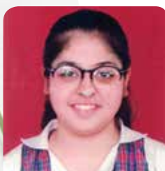
Kritika English 99, Science 99 Hindi Course B 99