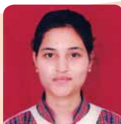
Shivani Music 89, Painting 99