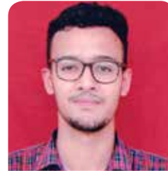
Srish Engg. Drawing 99