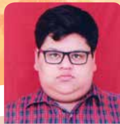
Shrey Moda Food Production-IV 96 Food Production-III 92