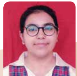
Parnika Geography 92