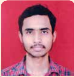
Abhinav Engg. Drawing 99