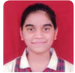
Sanya Engg. Drawing 99